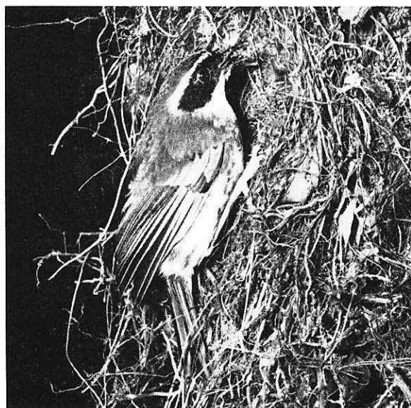
● Yellow-throated Scrub-Wren at entrance to nest.

090-77125. Banded by D. J. Wimbush at Waste Point, Kosciusko region, NSW on 6 Sept. 66. Caught (released with band) at Island Bend Dam, Snowy Mountains, NSW on 18 Sept. 73, over 7 years after banding. 13 km NW.