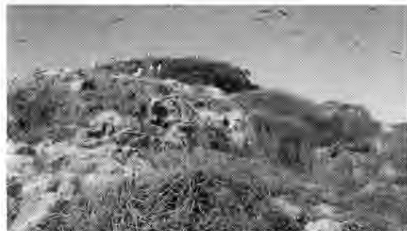
• Silver Gulls on Creek Rock, July 1996.