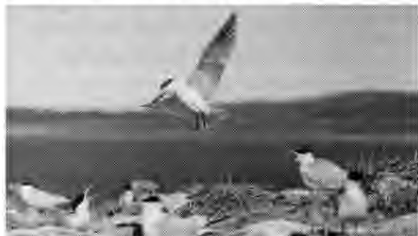
• Caspian Terns breeding on Creek Rock, June 1978.

Human visitation may have had a negative impact on the Caspian Tern breeding population. During the early 1980s an increase in human visitation was noticed, with sometimes up to three visitations per day from the adjacent mainland. By 1985, the numbers of Caspian Terns had begun to decline. Human disturbance causes the terns to rise from their nests, leaving eggs and small chicks exposed to predation by gulls.