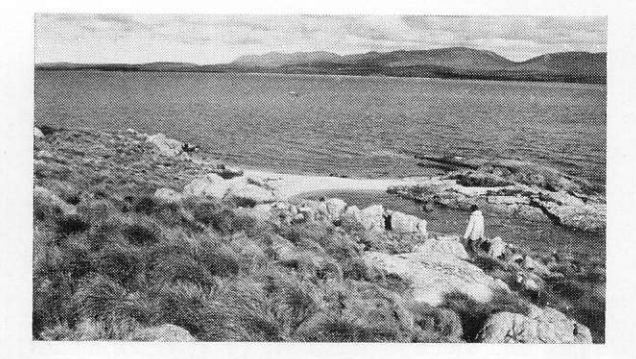
Another view showing the south-west corner.

• Part of the northern side (looking east).