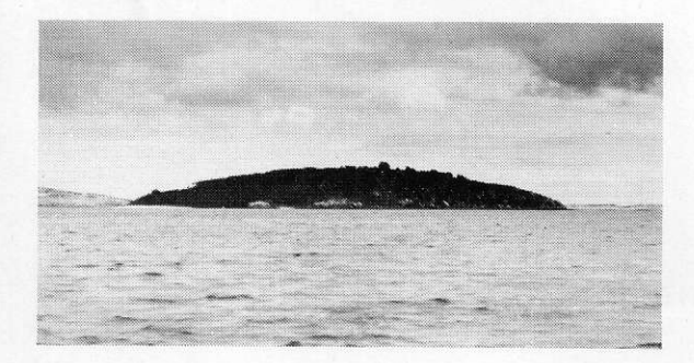
• Benison Island (looking south-west).

western sides under P. poiformis . A few burrows are located in other areas. Population not determined but considered to exceed several thousand breeding pairs.