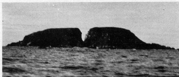
• Split Solitary Island from the north-west.

None recorded (No record was made during the 1969 visit and none was seen during the visit in April 1974).