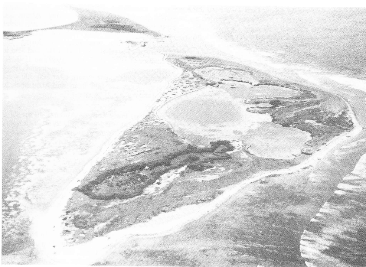
• Wooded Island (looking east); Morley Island in the background.