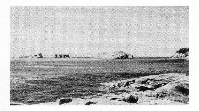
• The Nuggets — from right to left, Islets Nos. 1, 2 and 3 (looking south-east).

no suitable boat launching site on the adjacent coastline, and a rubber dinghy or canoe is probably the most convenient means of transport; these can be carried up the sides of the islets on landing.