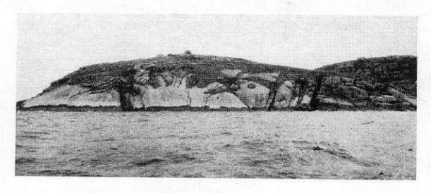
The north-eastern side of the island with Citadel Island in the background at right.